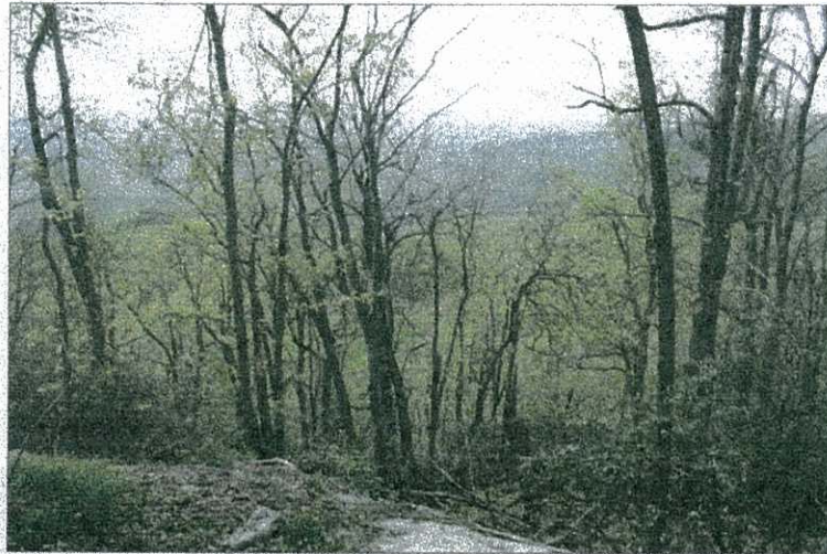
View from Glassy Top Mountain